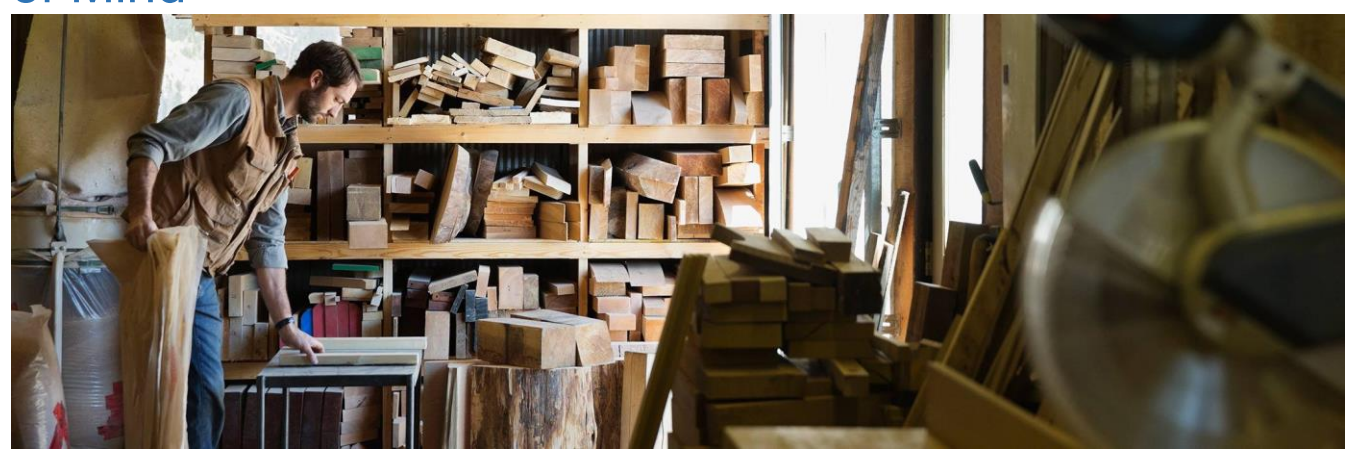
Thanks to shortline railroads, Long Island small businesses are realizing their full potential and improving daily life for those who call the island home.

Surrounded by the East River, the Atlantic Ocean and Long Island Sound, New York's Long Island has long been one of the least accessible marketplaces in the country despite being home to more than 7.8 million residents. Local businesses have traditionally had to transport goods, commodities and finished products to and from the island by road, crossing one of seven heavily congested bridges and navigating horrendous New York City commuter traffic along the way.